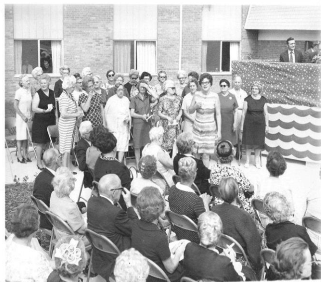
➤ September 20, 1970 Dedication Ceremony